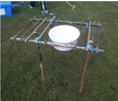
A typical camp gadget

aided and by 10pm everyone was having supper then going to bed.