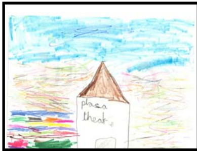
← The Plaza Theatre by Charlie (aged 7)