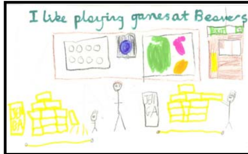
Playing games at Beavers Nathan (aged 6)