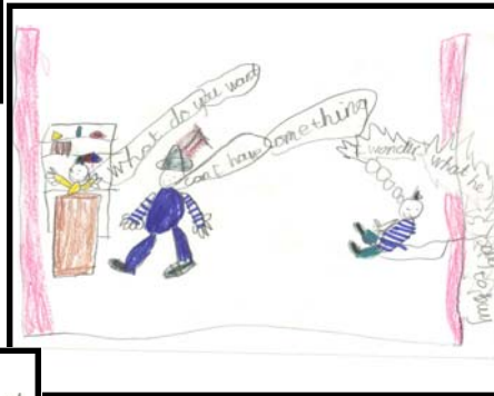
Ross (aged 7) →