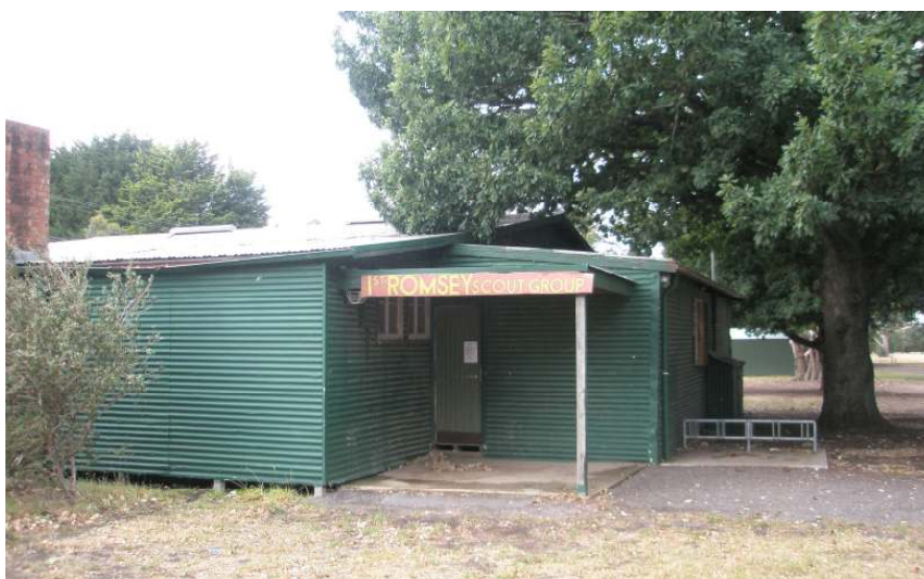
1st Romsey Scout Headquarters.

Today, residents are more likely to be commuters or hobby farmers. The town is well equipped for modern living, with a medical centre, shops, schools, kindergartens, sporting facilities, a voluntary fire brigade, Scouts & Guides and a mobile library service.